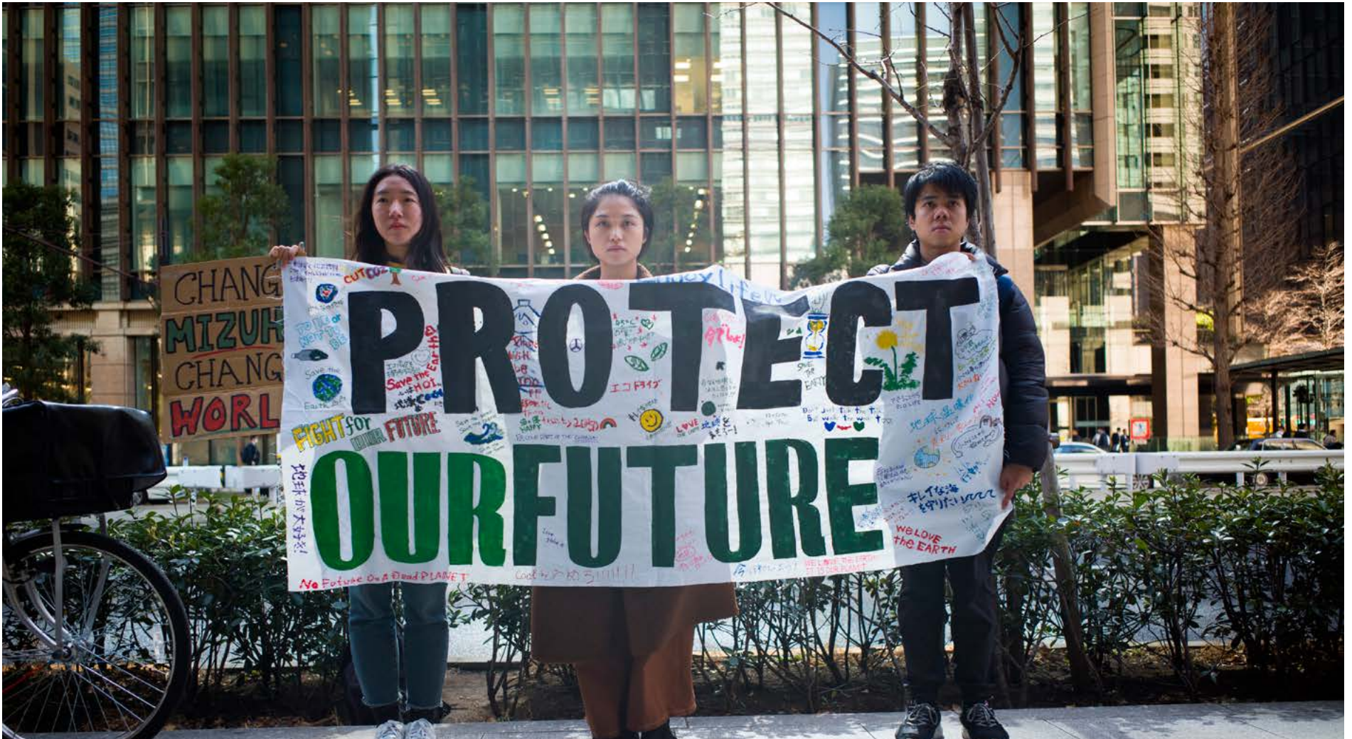
Youth climate activists protest outside the Mizuho Financial Group Inc. headquarters in Tokyo, Japan, in March 2020 to denounce its role in financing international coal projects.

exposed challenges of sustainability. An enabled, adequately resourced and strongly networked civil society, focusing on mutual solidarity rather than competition, is needed to match our ambition. We can and must play our full part in ensuring a recovery that does not try to go back to the old normal, but rather goes forward to a new better.