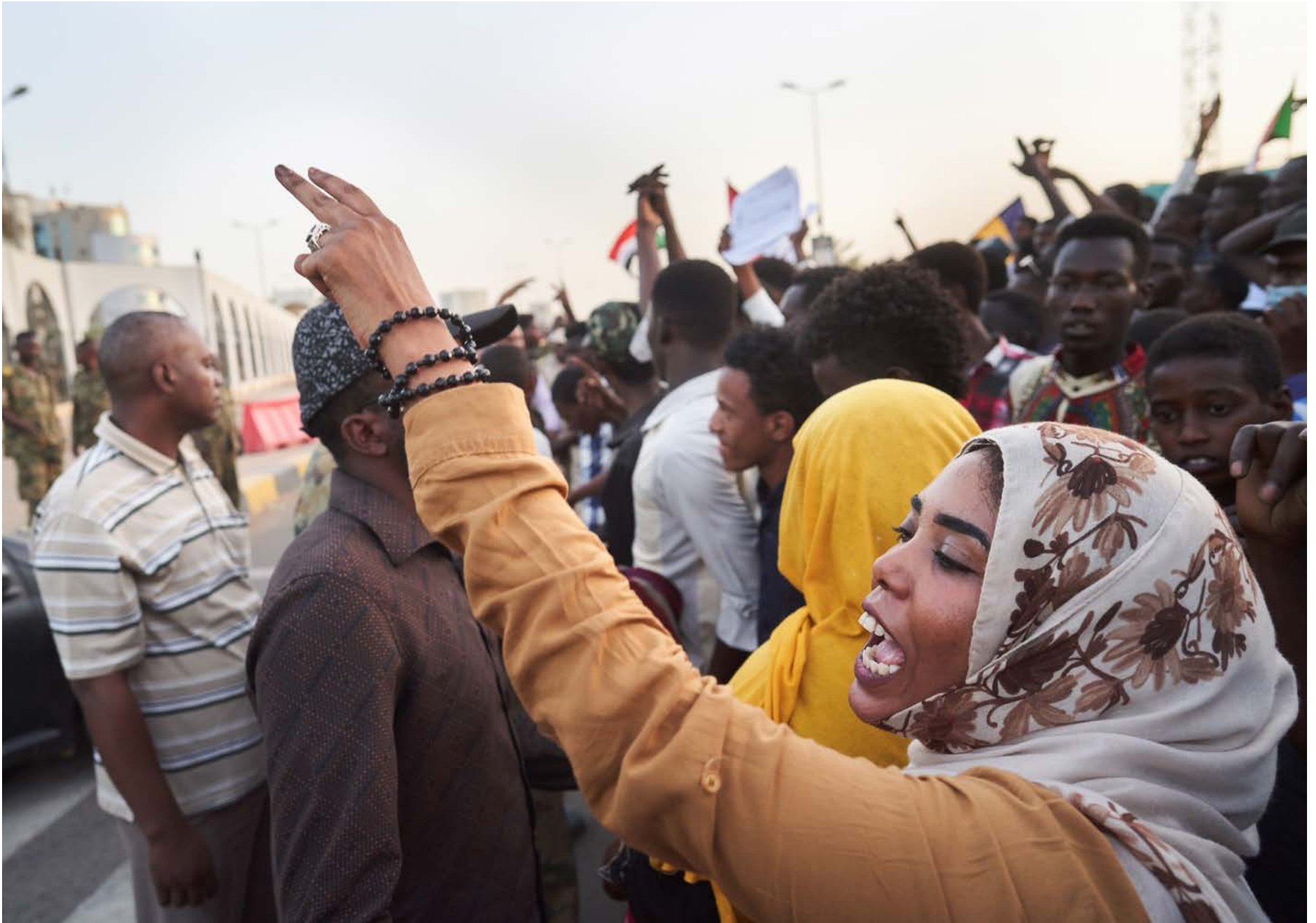
Protesters defy the army outside military headquarters in Khartoum, Sudan, in May 2019.