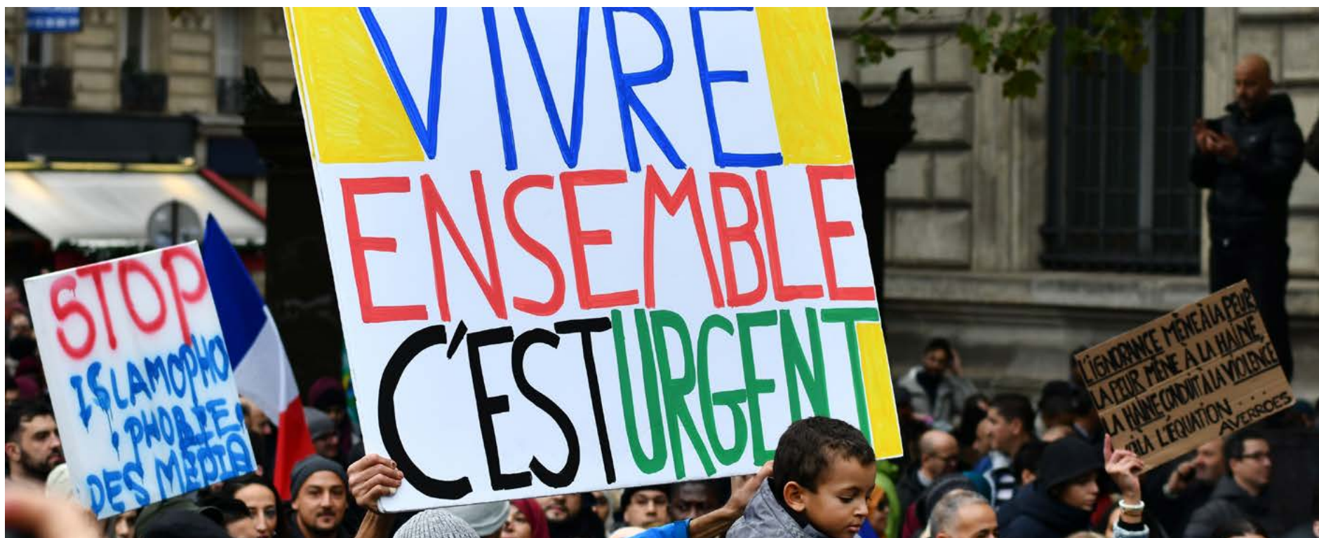
People in Paris, France, protest against Islamophobia in November 2019.