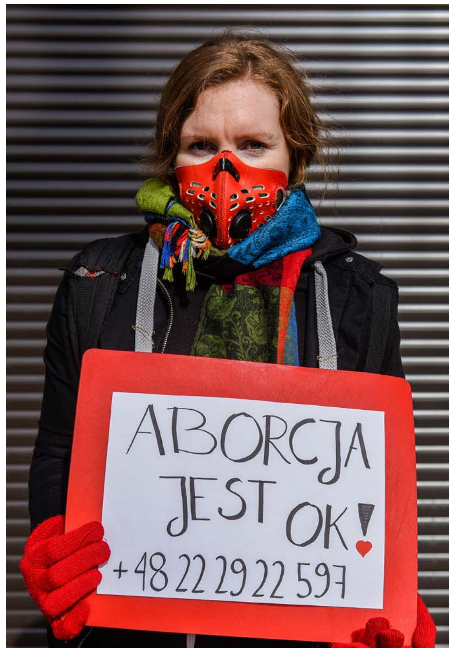
An abortion rights activist protests against a restrictive bill proposed during the COVID-19 lockdown in Kraków, Poland.