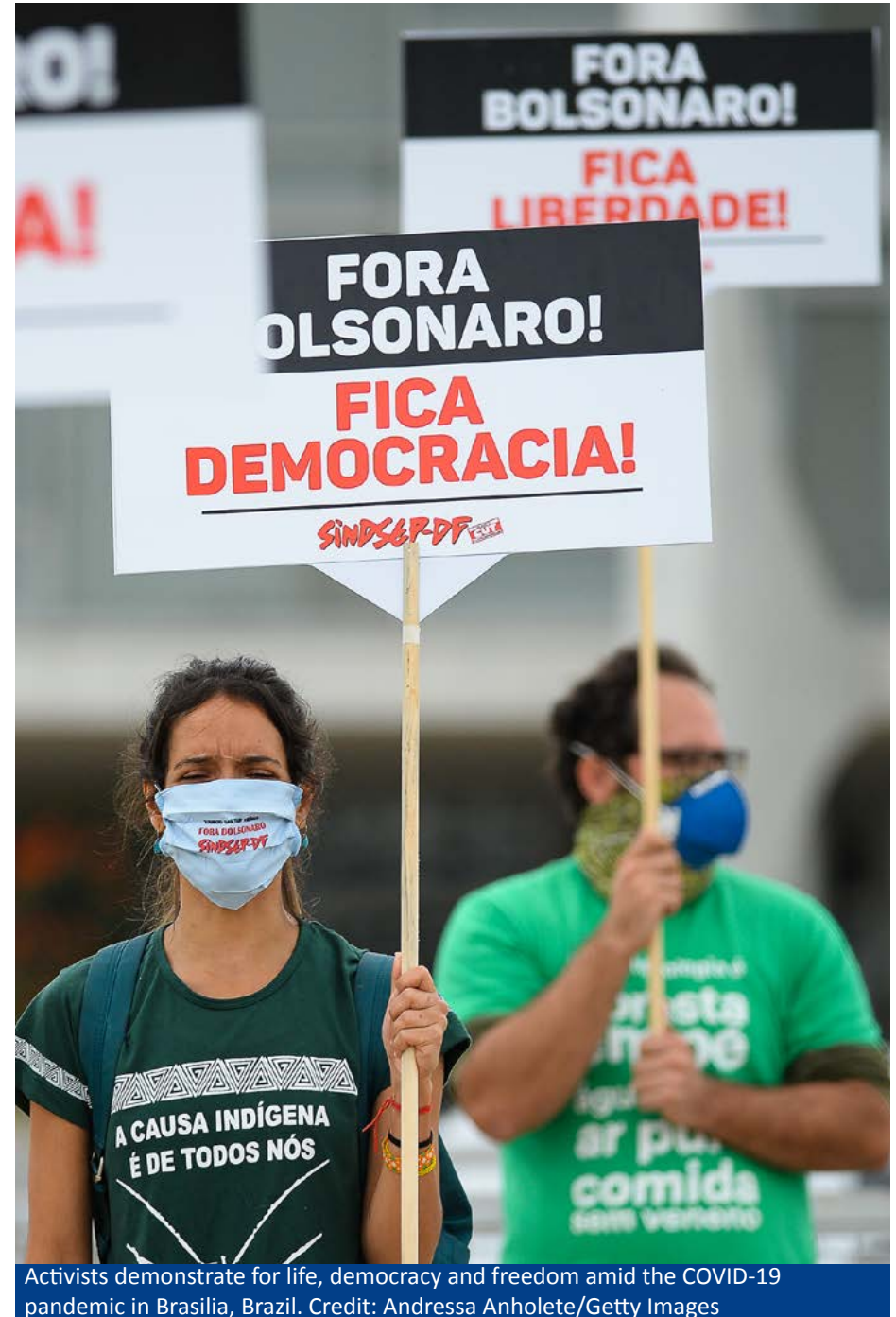
Activists demonstrate for life, democracy and freedom amid the COVID-19 pandemic in Brasilia, Brazil.

Civic rights and democratic freedoms are needed now more than ever. Civil society needs to be unfettered, so we can play our proper role in pandemic response and scrutinising decisions taken in response to the crisis, help ensure the lessons are learned and become equal partners in post-pandemic reconstruction. In the immediate period of virus response, measures to protect public health should respect human rights . We need to challenge censorship, restrictions on access to information and infringements of personal privacy, and expose overreach by governments, such as illicit surveillance. We need to continue to advocate for people's right to express democratic dissent. We need to demand that all emergency measures stand the test of proportionality and necessity, in line with international law and the principles enshrined in the Universal Declaration of Human Rights, and are withdrawn as soon as possible. Looking ahead, we will need to promote new strategies to combat disinformation and new models of inclusive and accountable leadership. Civil society will keep pushing for open civic space, and will urge governments to adopt people-centred and partnership approaches to reconstruction that satisfy the demand for positive change. As part of this, economic stimulus packages prepared by states should recognise the need to enable the adequate resourcing of civil society and ensure the sustainability of organisations on the ground and in the global south.