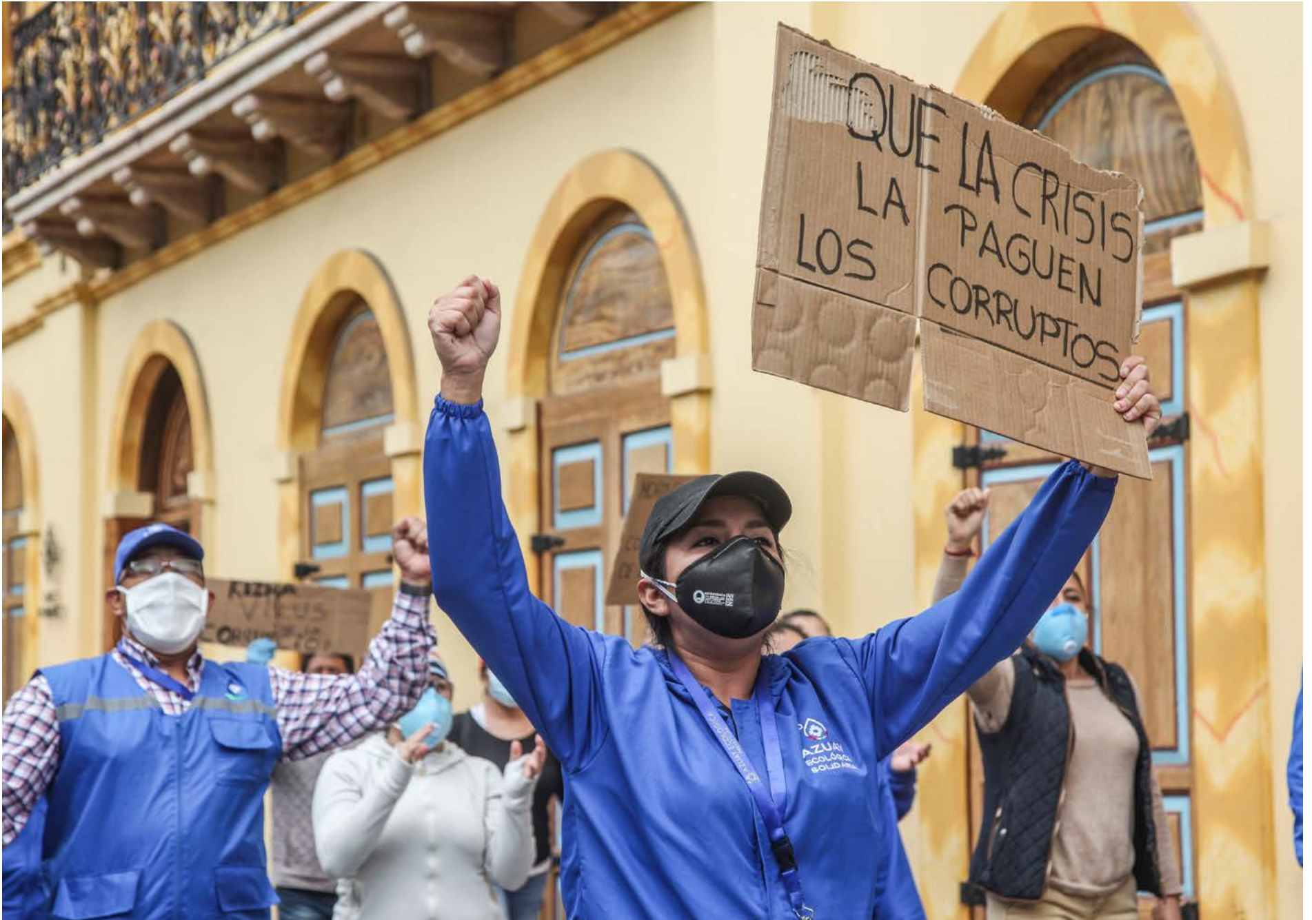
Ecuadoran student protesters carry a sign that reads 'Let the corrupt pay for the crisis' in May 2020 in Quito.