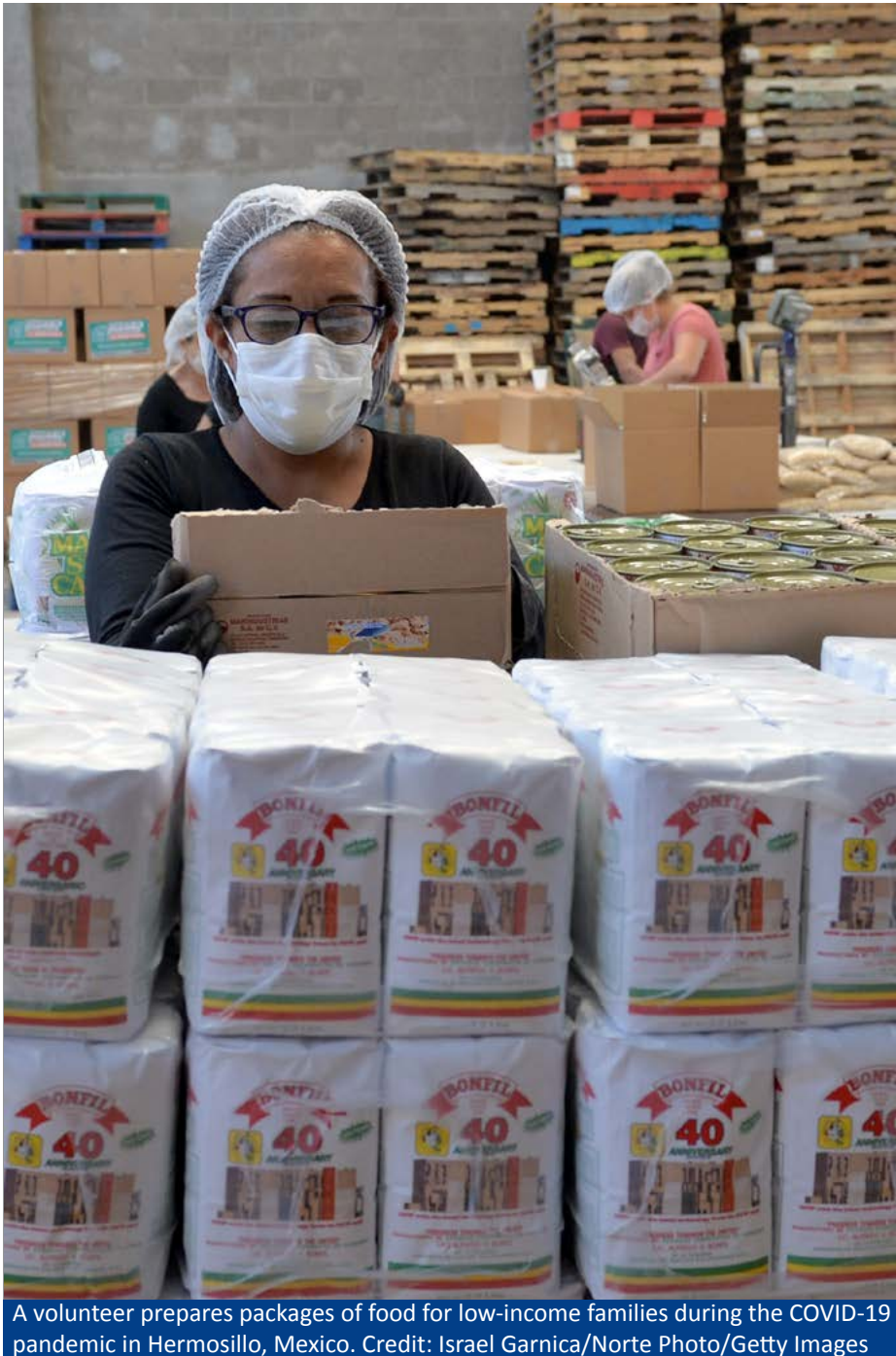
A volunteer prepares packages of food for low-income families during the COVID-19 pandemic in Hermosillo, Mexico.

ensorship, limitations on access to information and violations of the right to privacy, and threats, arrests and detentions of civil society activists, journalists, frontline workers and other concerned people who disclosed information about the pandemic, questioned their government's response, or exposed failings. In multiple cases, security forces used violence against people deemed to have violated lockdowns, while for human rights defenders in detention , the risks of infection were alarming. In too many contexts, a state power-grab appeared to be underway, raising the risk of a permanent institutionalisation of emergency measures that would roll back fundamental freedoms.