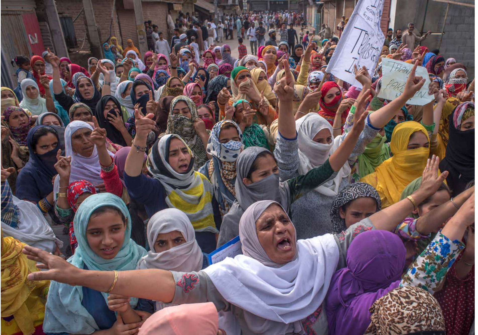
Muslim women protest against India's revocation of the special status of Jammu and Kashmir.